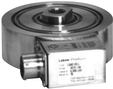
Models 3272, 3273 and 3274 Capacities 100 lbs. to 20,000 lbs.

Tension and compression 100 lbs. to 200,000 lbs.