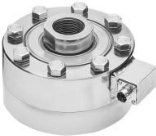
Models 3275, 3276 and 3277 Capacities 50,000 lbs. to 200,000 lbs.